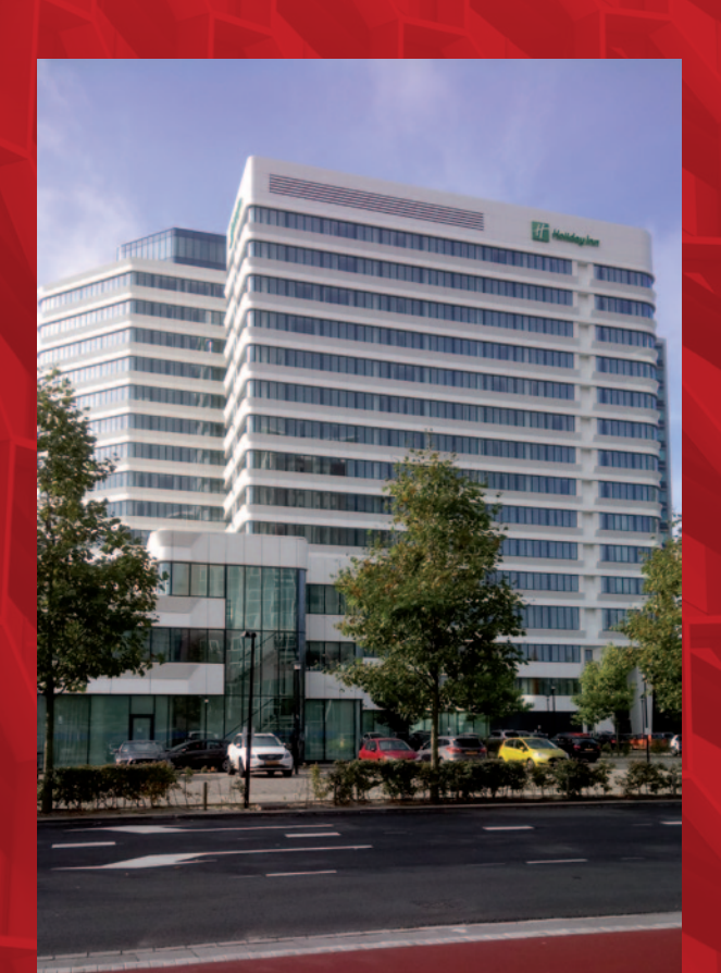
Holiday Inn and Holiday Inn Express Amsterdam Arena Towers, 443 Bedrooms

All hotel companies need a strong hotel audit function to check compliance with company standards, evaluate any risks to the business and to provide a check against fraud and malpractice. Outsourcing your internal hotel auditing requirements to a hotel audit contractor allows for your business, no matter how large or small, to have access to very experienced industry professionals at a cost to suit your budget.